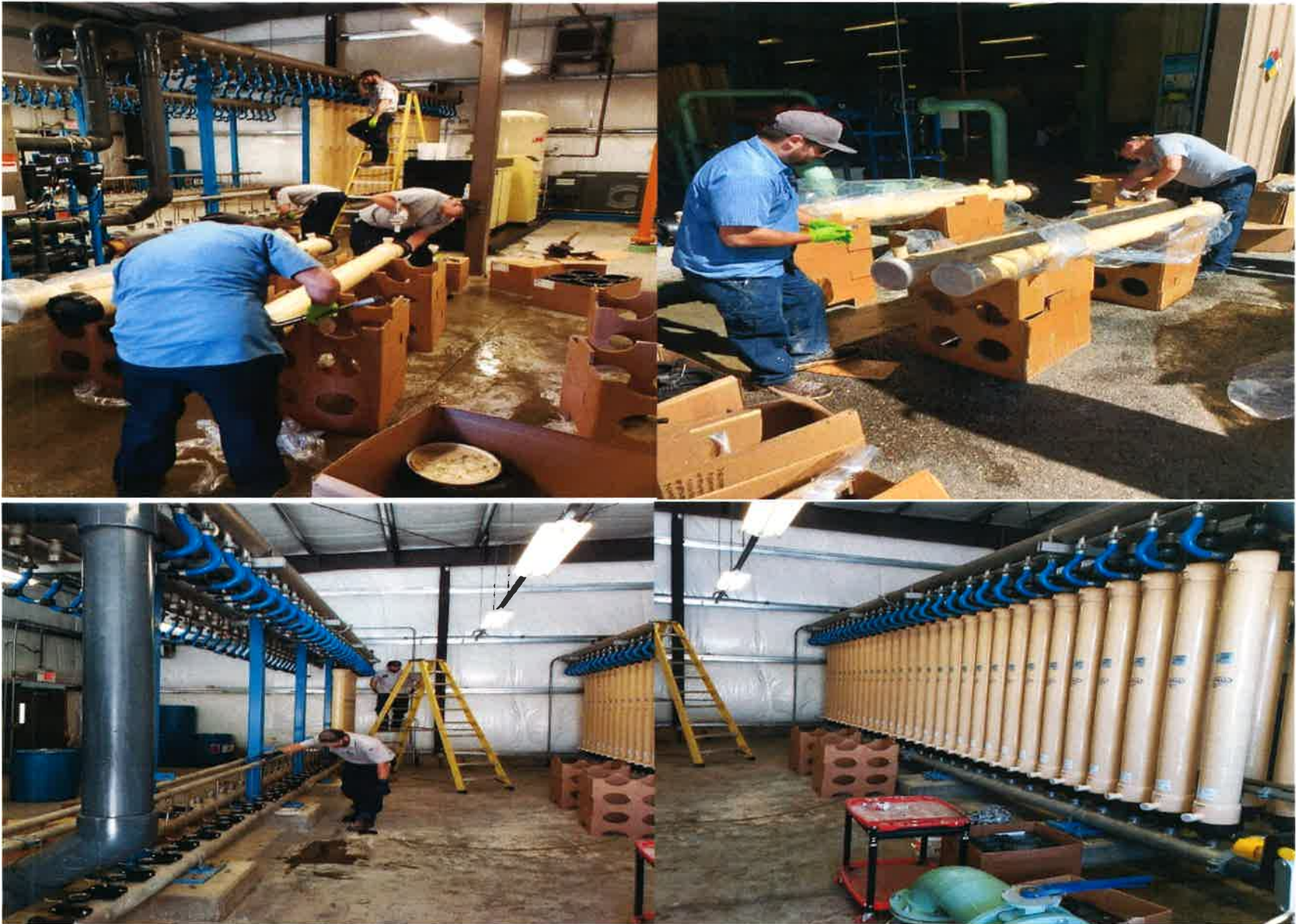
Grass Valley WWTP Pall module installation