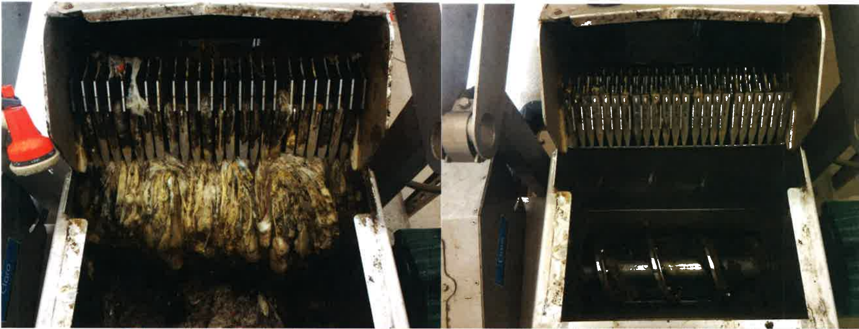
Post-storm surge maintenance. Willow Creek WWTP step screen before and after photos