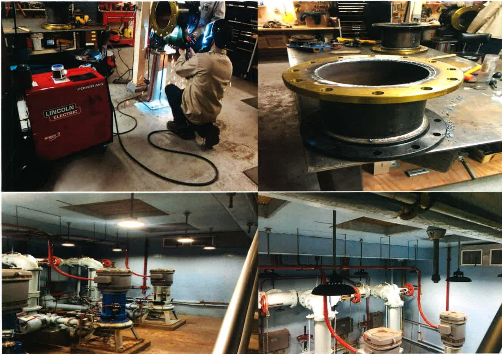
LS #5A- Mechanical Maintenance Department replaced existing 4' fluorescent lights with more efficient LED lighting